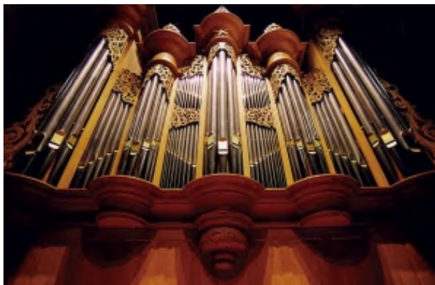
Cathedral of the Holy Name